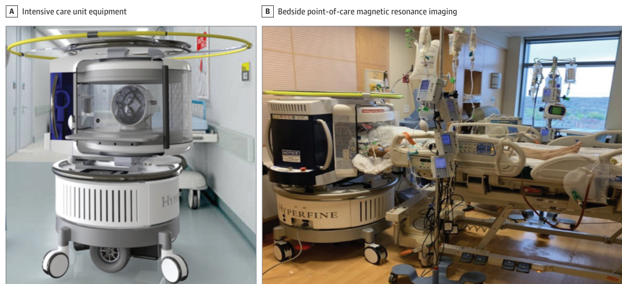
Figure 1. Point-of-Care Magnetic Resonance Images (0.064 T) in an Intensive Care Unit Room

All intensive care unit equipment, including ventilators, pumps, and monitoring devices, as well as the point-of-care magnetic resonance image operator and bedside nurse, remained in the room. All equipment was operational during scanning.